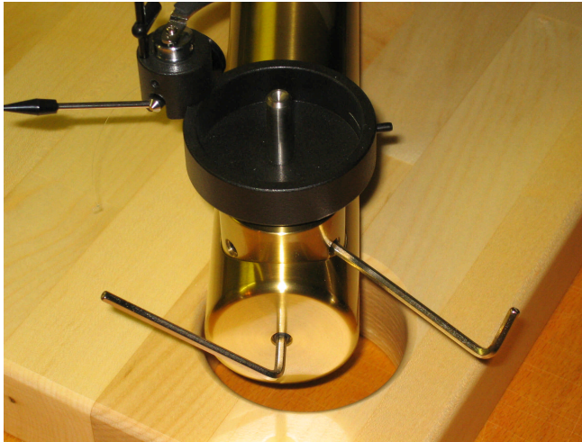
The bearing base in its brass pillar on Stabi S. Fig. 2.