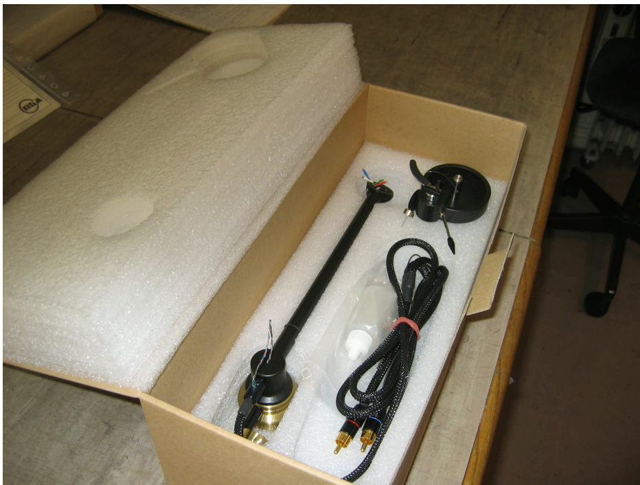
Stogi S packaging Fig 1

Armbase for other turntables with accessories ( 3x hex screw and nuts, Allen key 1.5, 3mm), mounting protractor, fingerlift for headshell.